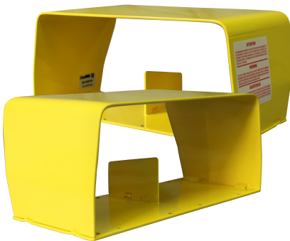
Dual Yellow Guard