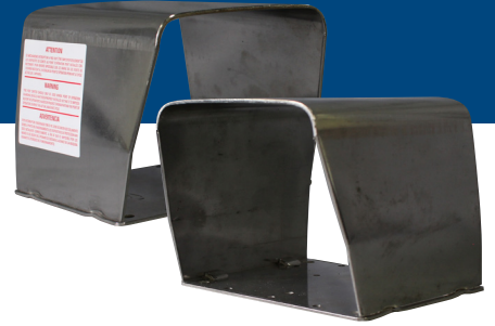
Single Stainless Guard