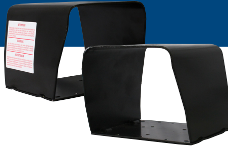
Single Black Guard