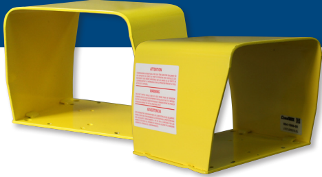
Single Yellow Guard