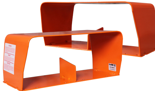
Dual Orange Guard