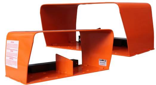
Dual Orange Guard